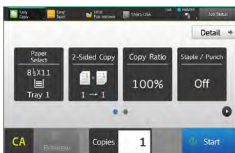
Easy Copy Screen offers the most commonly used settings.