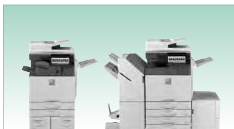
MXM2651 shown in both a compact configuration with inner finisher and full configuration with saddle-stitch finisher and large capacity cassette.